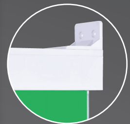
Side mount bracket included