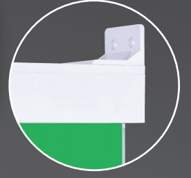
Side mount bracket included